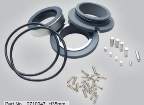
Part No. 2710047 H35mm Part No. 2710048 H50mm Part No. 2710050 H75mm