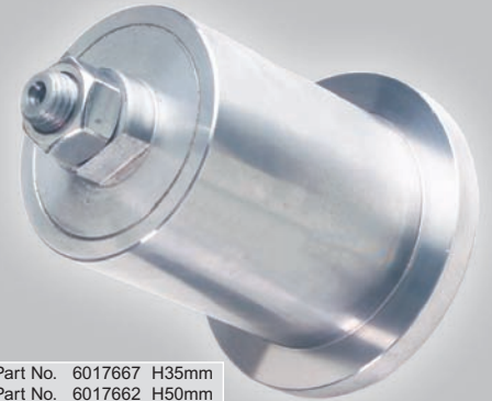
Part No. 6017667 H35mm Part No. 6017662 H50mm Part No. 2713007 H75mm